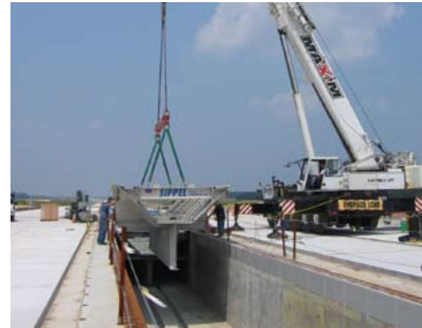
Workers from Hensel Phelps lower a piece of the electromagnetic aircraft launch system into place.

Hensel Phelps Construction Co., a more than 70-year-old Colorado-based company with vast experience building both public and private projects, won the contract to build this prototype. Building the EMALS facility was extraordinarily complex. The project accounts for 15 acres at the Naval Air Engineering Station in Lakehurst, New Jersey and, now complete, looks much like the top of an actual aircraft carrier.