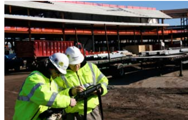
Personnel use a tablet PC outfitted with Vela Systems’ software to update field information.

Specifically, Skanska wanted to track the more than 3,200 pre-cast concrete pieces that will form the seating bowl of the 84,000-seat stadium. Each of these pieces weighs about 45,000 pounds and measures 44 feet by 10 feet. What’s more, each piece is custom-made for a specific location within the bowl, and, generally, they are not interchangeable. A JIT delivery system means that Skanska does not need to establish a lay-down yard, but can instead rely on a small holding area for trailers. The goal is to install the pieces shortly after they arrive, which speeds production. However, this type of system means that if the wrong piece is delivered, or if it fails to pass the stringent quality controls, there could be no place to store it until the correct piece arrives, causing backups and cost over-runs.